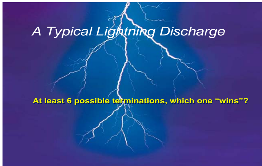
Figure 3: Leader Situation before Termination

To understand the details of the termination phase of a lightning leader approaching a DAS, it is necessary to understand the leader situation just before “touchdown”. This is illustrated by Figure 3, a very unusual photograph that is paramount to understanding the DAS performance. It depicts the situation at a few microseconds before termination. Please note that there are many branches, with at least six in the foreground. All are about the same distance above earth; one must terminate. The objective is to prevent that one from termination on or in the DAS protected area.